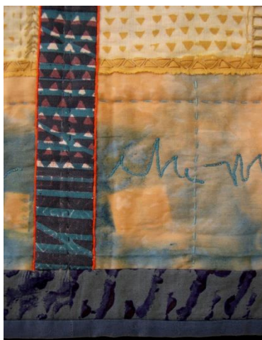
Lower center detail, “Lost Language II: Ancient Teachings”

Participants will bring all their own supplies and will take away sketches, lists, samples, studies, and new ideas . The class will not focus on making finished artwork but, rather, on pointing ways forward on your longer creative journey.