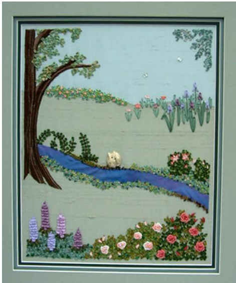
Kim Sanders – Step 1

Examples of successfully completed pieces: