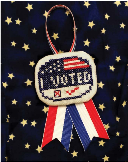
PHOTO: STITCHED AND PHOTOGRAPHED BY MARNIE GRALEY; DESIGNED BY TRACY HORNER, INK CIRCLES