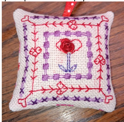
Picture of Finished Project (with the Rose Flower Charm added): I HEART YOU