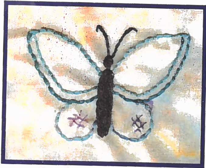
OUTLINE & STEM STITCHES