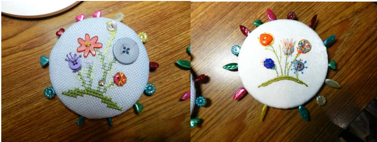
Picture of Finished Project: Left Counted Cross Stitch; Right Surface Embroidery

This little project was created just for the EGA Stitch-a-long FB group so you can bring your buttons to bloom! This project can be used as a pin cushion, a jar cover, or, as shown as a pinwheel. Enjoy!