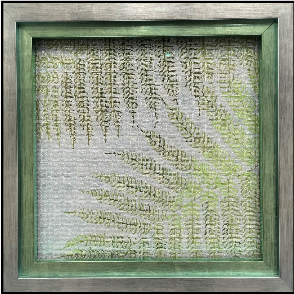
Fern , stitched by Marge Kelly; Best in Show for 2021 Golden Needle Exhibit