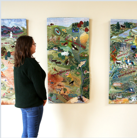
National Tapestry: America the Beautiful