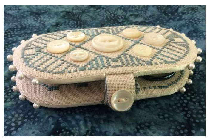
Front view showing class & the clasp is magnetic.