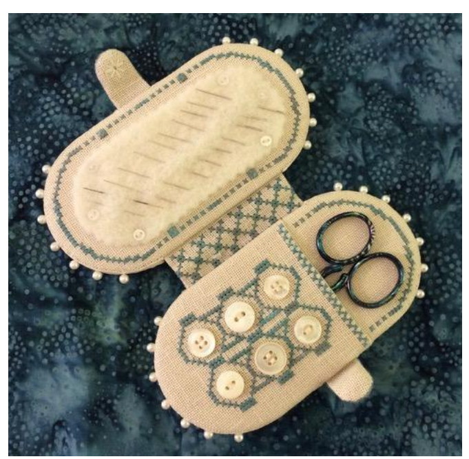
Opened flat, interior view