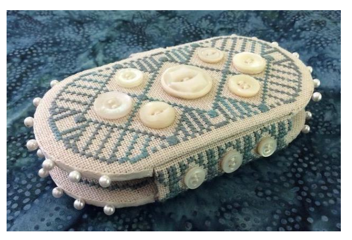
Back view showing hinge

This constructed etui has been designed to hold necessary stitching supplies. It opens to reveal a needle page and a scissors keeper. The edges of the book act as a pinkeep. Buttons of the student's choice are an integral part of the design areas. Buttons from the button jar, antique buttons, or purchased buttons may be used. The majority of the stitching is cross stitch over two. Additional stitches used are: cross stitch over one, reverse chain, lacing the chain, and one optional specialty stitch.