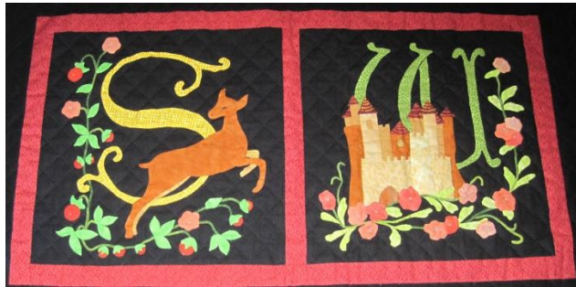
Sandra Dadik Step 2

Examples of successfully completed pieces: