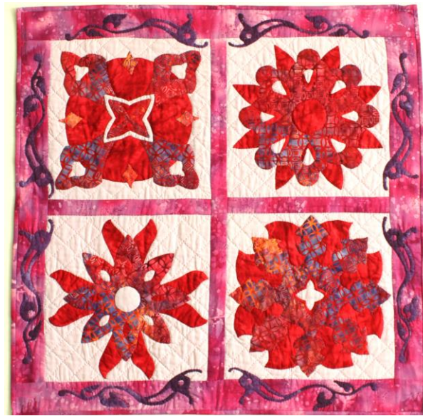
Diane Rocheleau Step 2